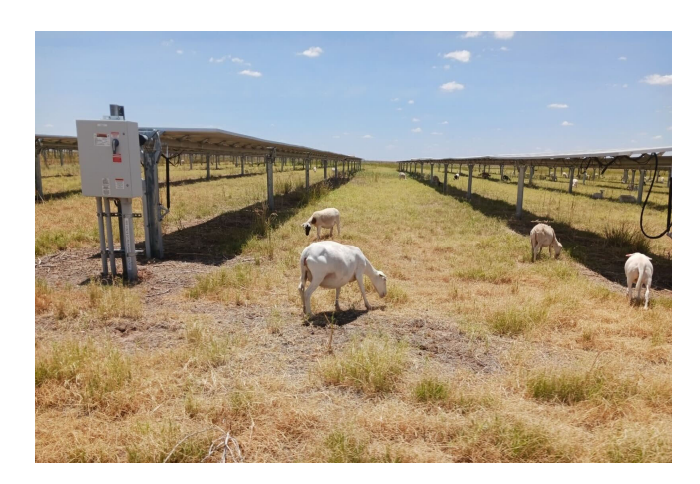
Fig 1. Revegetation substantially reduces the small temperature increases under a solar array