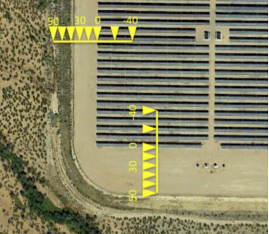
Fig 2. The small temperature increases observed at an unvegetated desert project was negligible within 100 ft of the edge of the solar array